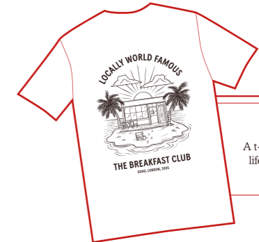
The Legacy Tee A t-shirt for everyone who lives a life bathed in eternal sunshine.