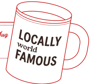
Locally World Famous Mug A mug for the quietly confident 10.00