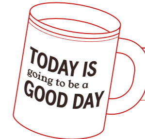
Good Day Mug A mug for the eternal optimists 10.00